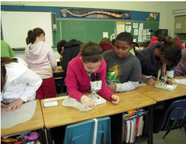
Fifth graders take a closer look using recently purchased microscopes